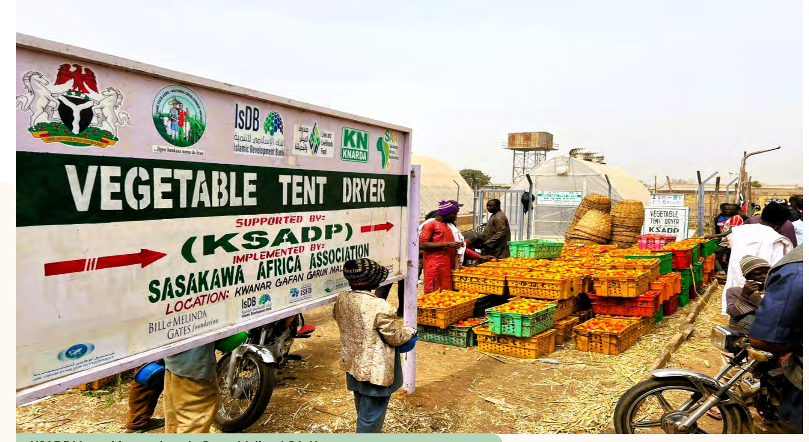
KSADP Vegetable tent dryer in Garun Mallam LGA, Kano state