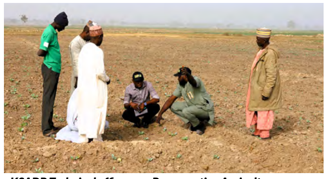
KSADP Technical officers on Regenerative Agriculture interracting with beneficiaries durnig a field visit to Kura LGA